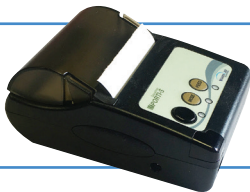
Mentor bluetooth printer (optional)

Up to 50 test results can be stored by vehicle registration or VIN. The USB connection together with the Automotive Refrigerant Configurator PC app can be used for software updates, sensor calibrations and simulating connection to a refrigerant recycling station.